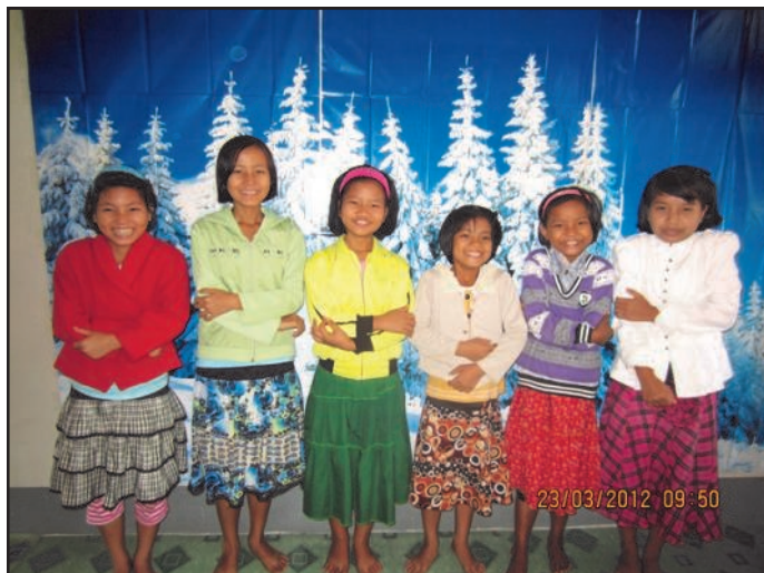
A few of our girls standing in front of a snow scene, pretending to be "cold." It was only about 100 degrees Fahrenheit when this was taken :-)

Twenty-one students, in grades one through eight, took their examinations from February 20th through the 24th. When asked how they thought they did, the students all said they could answer the questions, so we believe they all did well. The final results will be posted in April.