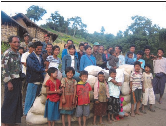
Some members of the tiny village of Aishi

One of the ways your gifts help the people of Myanmar is by feeding the hungry. In March MyHope received an emergency request for food from a village that had recently experienced a devastating loss and were almost totally out of food.