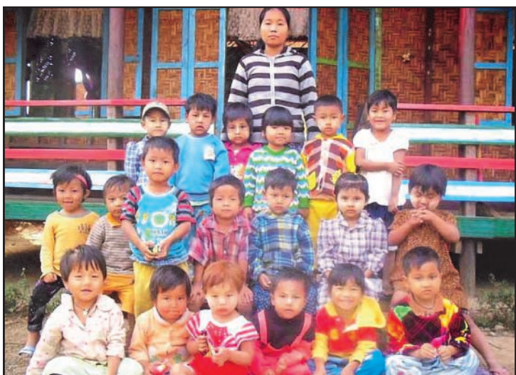
The teacher and children of Hope Preschool in Tamu

In order for the preschool to succeed and continue long-term, we would like to be able to hire an assistant teacher as well as help even more children. Please consider helping these children by committing to a monthly donation of any amount. If the Lord is prompting you to help them, please call 217-415-9187, or email info@myanmarhope.org . God bless you!