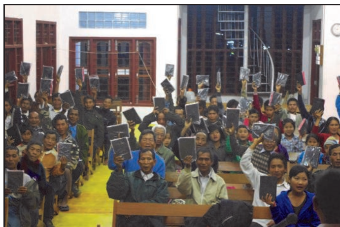
Conference attendees holding up their new Bibles

The Kuki tribe are part of the Chin ethnic group, a diverse people that inhabit the hilly country stretching over west and northwest Myanmar, northeast India, and even into Bangladesh. The vast majority of the Kuki live in Manipur State in India. The Myanmar Kuki were cut off from their Indian relatives when the borders were fixed after World War II. The resulting isolation of the Myanmar Kuki villages left them at or near the bottom of the social hierarchy among the other Chin tribes in Myanmar, who viewed them mostly as outsiders. The Chin themselves are low on the overall social hierarchy of people groups in Myanmar (the Burmese are the highest), and have suffered much persecution and discrimination over the past fifty years.