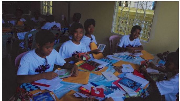
HBS kids excitedly looking through all the cards and letters given to them by their sponsors and other individuals in America