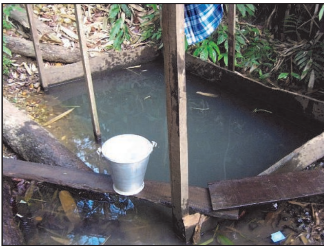
New Canaan's water supply

As mentioned earlier, Palal also requested a grant to help New Canaan Village with their water supply. As you can see in this photo, they were in desperate need of help: