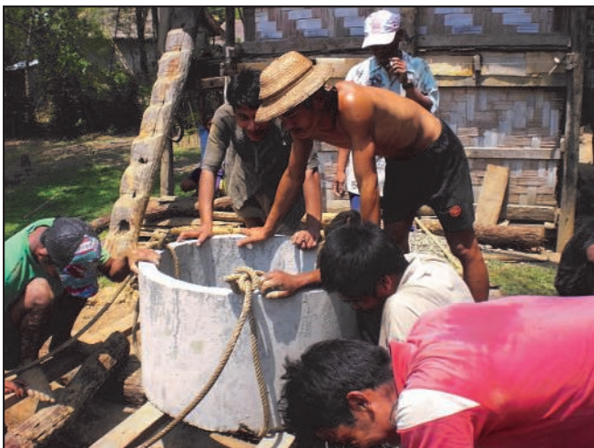
Lining the well with concrete retaining walls

I.D.E.S. graciously provided enough funds to help rebuild an old well that had fallen in and was no longer able to be used. The old well was dug out and the walls were lined with rings of concrete for reinforcement.