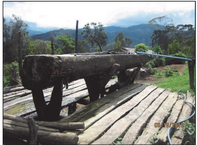
Sulpi Village's original water supply tank

both cleaner and large enough to meet their needs.