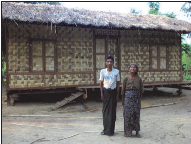
The happy couple in front of their new hut

Thank you so much for your donations to the Pastor and Family Support programs. Your prayers and financial support enable our brothers and sisters in Myanmar to do the work of the Gospel and take care of the truly poor and needy among us!