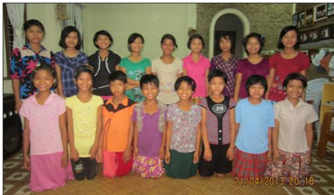
All of the HBS girls posing for a group photo

To watch a short video slideshow of the progress to date, please go to http://goo.gl/21vPE