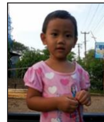
Cherry Nem Nei Them