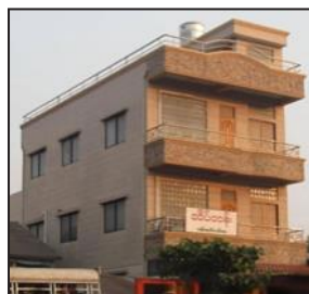
Example of what the new building will look like when complete

There has been a tremendous amount of progress since our last newsletter! At that time, the lot had been cleared and leveled. Now the foundation, ground floor concrete structure, and first floor are in place, and the second floor is going up as this is written.