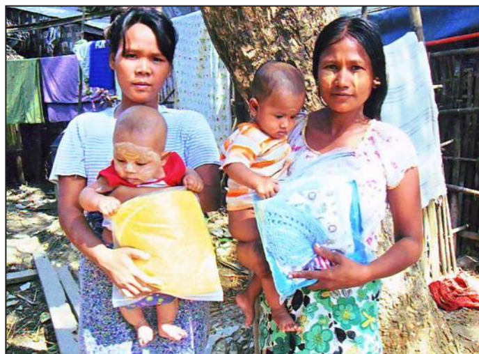
Young mothers from Dalah Township receiving their layettes

* Many of the supplies for the layettes were donated by two other groups at West Side, "Women in Study" and the TNT Adult Bible Fellowship.