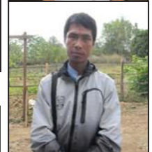
Some HBS Parents