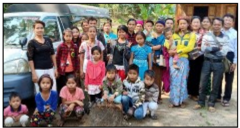
These family members will be visiting their relatives in the prison for the first time.

The wood and bamboo structure that we recently built will remain and will be used for overflow and for church services when necessary.