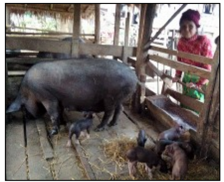
A widow with pigs from the Piglets Project

her first litter, the family agrees to give one or two female piglets back to the project, to be given to other families. After that they are free to use the original pig and the piglets however they choose.