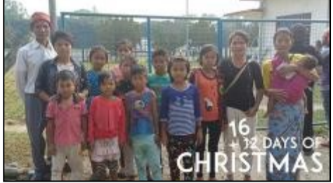
Thank you, West Side Christian Church

This is an wonderful gift that will impact families and prison inmates for many years to come. The new building will be used as a guest house for families visiting their relatives in the prison, as well as a home for the leaders of the ministry. The building will also have a large open area for worship services and meetings.