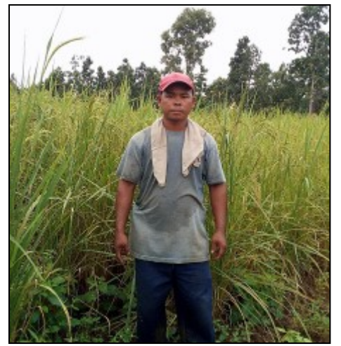
Our tractor operator at the East/West Garden

One of the items on our project wish list for 2019 is to expand the number of