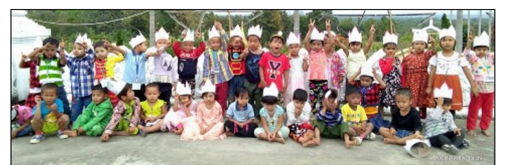
Some of the children of Hope Preschool on a recent field trip

Those of you who sponsored these students throughout their time at Hope Boarding School should feel a great sense of pride and mutual accomplishment! It is because you made the monthly financial sacrifice to pay for the education, food, clothing, medical, and housing for these young people that they were even able to be at Hope Boarding School, let alone pass high