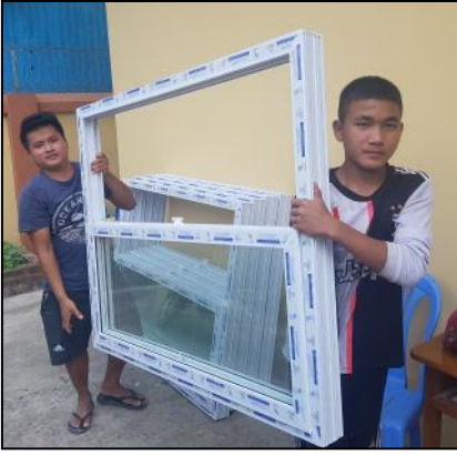
Installing new windows at the Boys' Dorm

building for a while until we can rebuild. We replaced the steel roofing over the garage and the veranda.