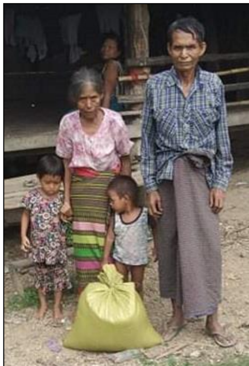
Your donations are helping to keep these families alive

God bless you all for your regular donations and especially for your many prayers. We could not be doing this work without you and your faithful partnership.