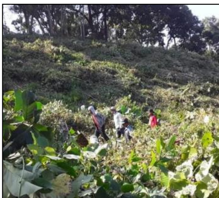
Clearing the land

This is a project which they wanted to start many years ago, but they could not afford to as they all are very poor and could not afford to purchase the