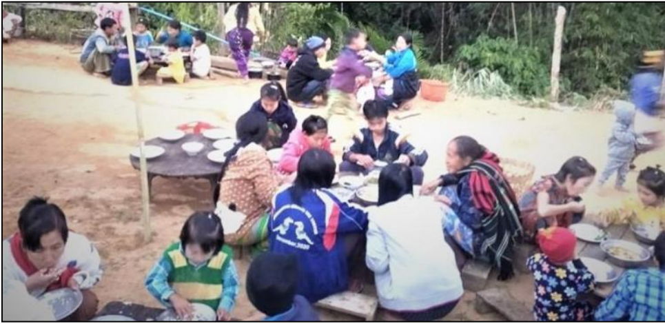
Celebrating Christmas together at one of the remote villages (name withheld for security)

strictions still in place, the people were living with great hunger.