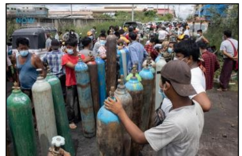
People stood in line for hours waiting to get oxygen tanks re-filled.

Thankfully, NONE of our New Pathway Home residents or staff were affected the virus! Even though they are elderly and at very high risk, and even though the virus was killing people all around them, God protected them all.