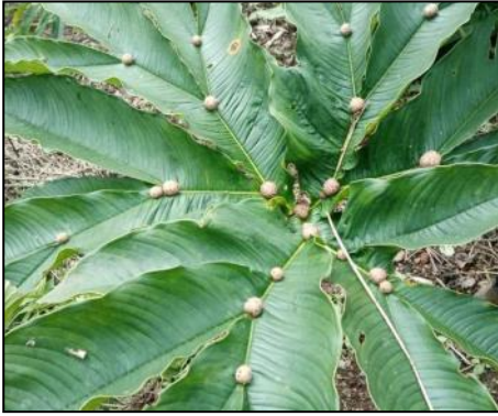
Yam bulbils ready to be picked

northern Chin State. It took us many days to transport the bulbils due to the COVID restrictions.