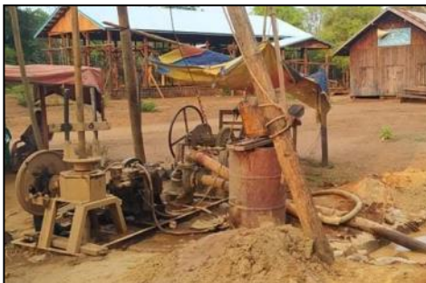
Digging the well at New Kanan

The water project at New Kanan took nineteen days, from April 29 to May 17. The team used a drilling machine to digging the well. They got clean water at 200 feet. Then they repaired an abandoned water tank that was built in 2008. It can store up to 1,500 gallons of water.