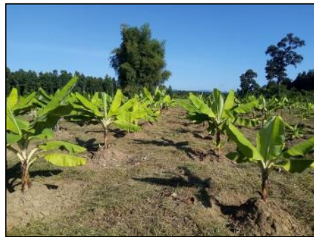
Brazil Banana Trees at the East/West Garden

We love adding any kind of seeds and new varieties of fruit and nut trees. We now have bananas, mangoes, cashews, tamarinds, lemons, and many more.