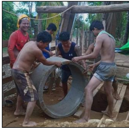
Putting in the well at Homalin

The Homalin congregation had been praying for a well for many years, but they could never afford to pay for a well by themselves. Now they have a new well and their prayers have been answered by God!