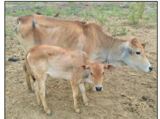
One of the many new calves at the East/West Garden

tion in the Northwest. Due to COVID-19 and the political crises we cannot hold our convention yet. So, as the number of our farm animals is increasing, we need to make more preparations for raising and feeding them in the future.