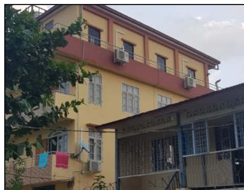
New air-con units installed

We used HBS funds for this installation. We are so thankful for the AC installation on the fourth floor! We can’t wait to hold more worship services with our HBS students and staff when they arrive back in Yangon.