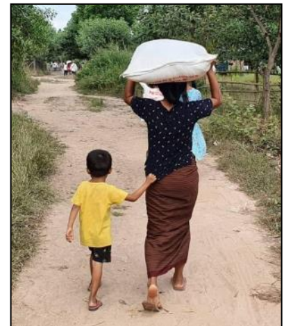
A mother taking food home to her family

Indeed, God heard the cries of His children every day. He kept His promise, found in the Gospel of Matthew: "Look at the birds of the air; they do not sow or reap or store away in barns, and yet your heavenly Father feeds them. Are you not much more valuable than they?" (Matthew 6:26).