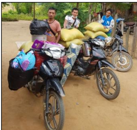
Delivering the food and other items to the family

God turned their pain and sorrow into relief and joy! Myanmar Hope also provided them with rice, blankets, cooking utensils, agricultural tools, etc., from our own funds. The family are so blessed with disaster relief funds and the I.D.E.S grant to build their new house and for their new household items.